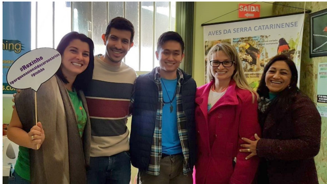
Instituto Espaço Silvestre team