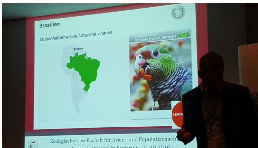
Funds for Endangered Parrots Annual Congress