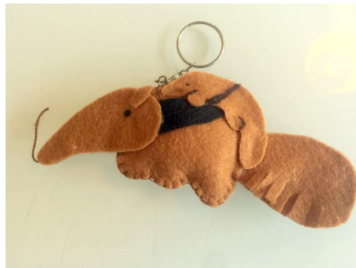
Anteater with baby keychain

Christmas is coming! How about getting your gifts while collaborating with the employment and income regeneration project ? Visit our virtual shop and get Brazilian fauna handcrafts made by the " Amigas dos Roxinhos ". There are amazons, macaws, giant armadillos, bats, azure jays, giant anteaters, owls, monkeys... You may also order the animal you want!