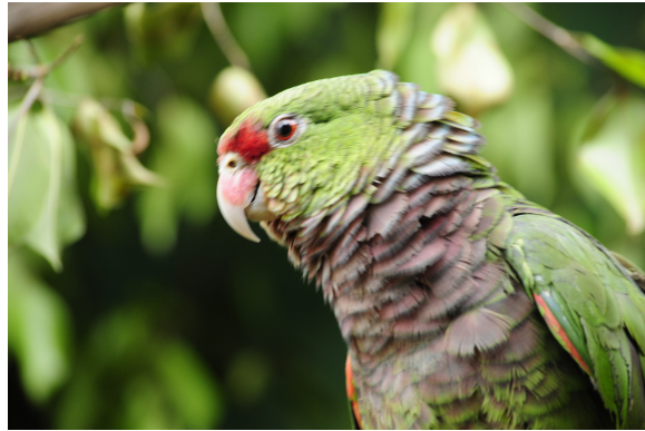
The beginning of the rehabilitation process

Espaço Silvestre Institute received 4 amazons from the Brusque Zoo Park for rehabilitation and potential release in 2017. Congratulations to the entire zoo staff for giving these amazing birds a chance of freedom, directly collaborating with conservation efforts. We hope their attitude inspires other institutions that keep these beautiful and endangered amazons to do the same.