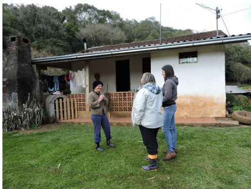
Educational activities in rural areas