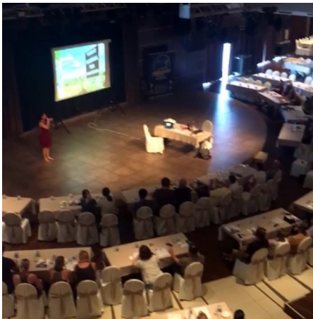
I International Bird Convention, Crete