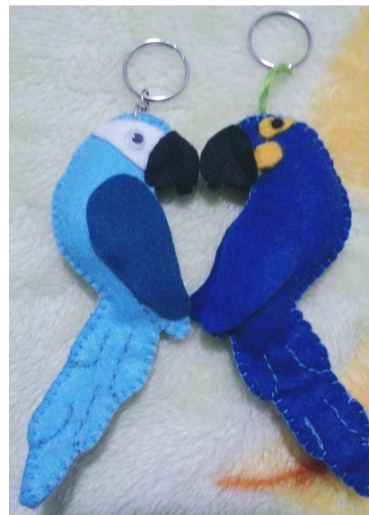
Lear's and Spix's macaws keychain

Did you know that Espaço Silvestre Institute participates in the captive breeding program of the Spix's Macaw and Lear's Macaw, coordinated by ICMBio (environmental public agency)? The knowledge gained from the vinaceous-breasted amazons is being used in conservation projects of these endangered species and also helping to generate income for the community. Order now your keychain handcrafted by the " Amigas dos Roxinhos ". Please visit our online shop .