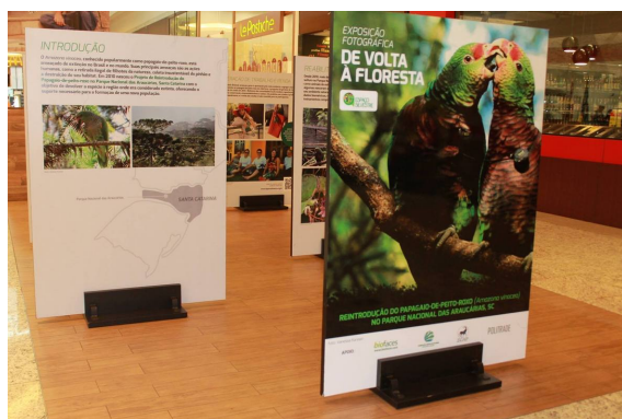
Exhibit in the Continente Shopping mall